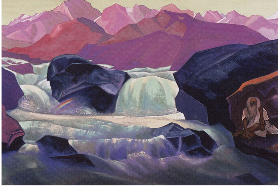
Nicholas Roerich-The River

This disjointed standoff called an inconjunct which has been building up to February 16, requires a back and forth presenting of issues, not expecting either side to fully relate to the other person's or sides position, but with the continuing battering away at presenting positions, information and issues, what occurs is a wearing down of the controlling and abuse of power, and breaks down into a truce, even though it might be temporary.