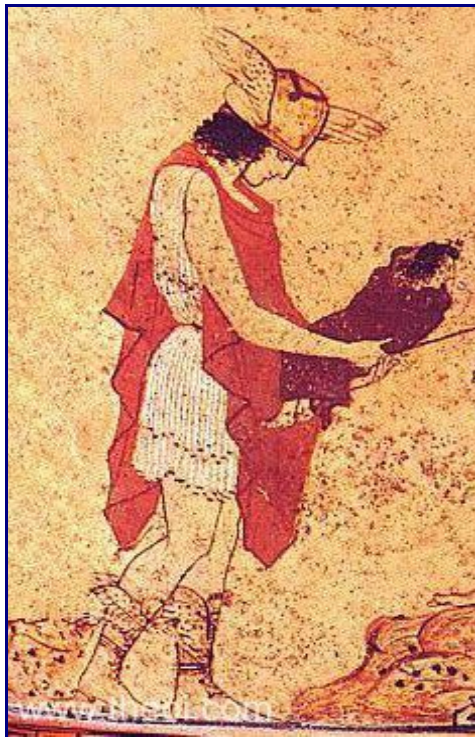
Hermes Trismegistus – God Mercury

Mercury's quicksilver brilliance combined with Uranus truth, tears down veils of deception from shadowy activities.