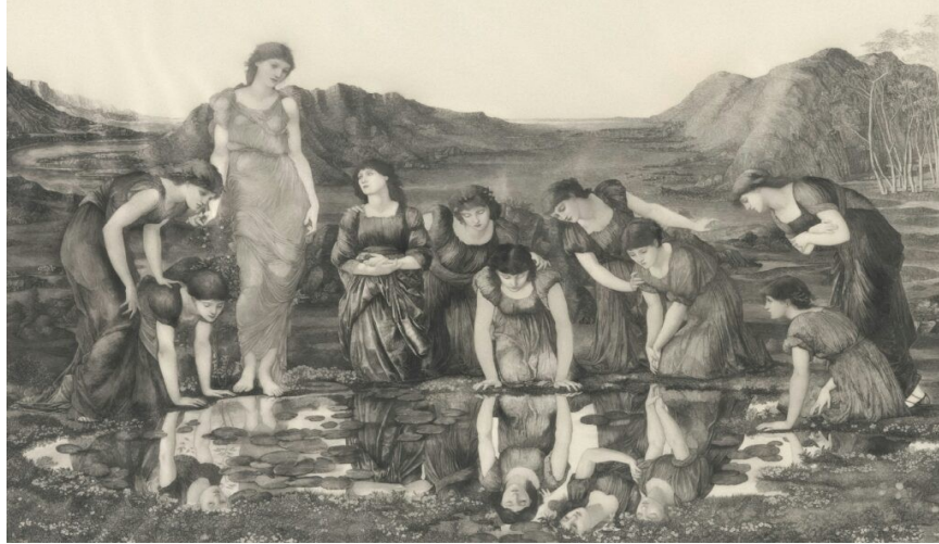
Artist Félix-Sanislaus Jasinski Title The Mirror of Venus Place United Kingdom (Artist's nationality:) Date 1896